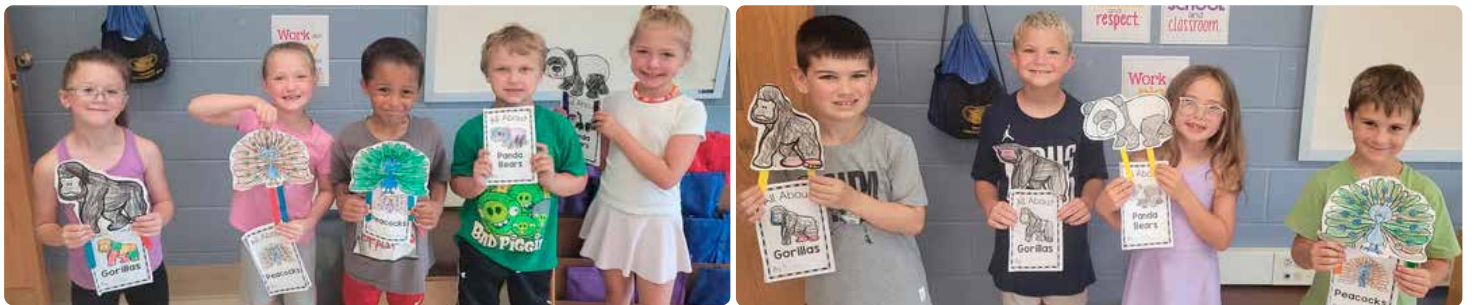
Zoo Animal Research