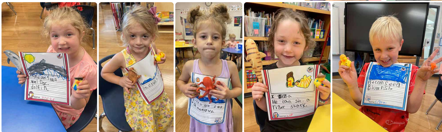
Kindergarten - 10 Little Rubber Ducks