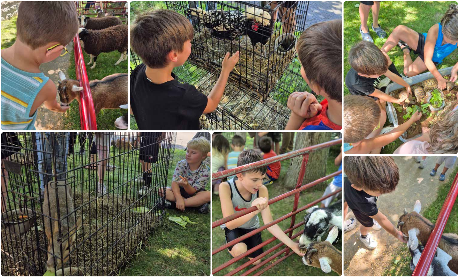
Petting Zoo at Blount Library