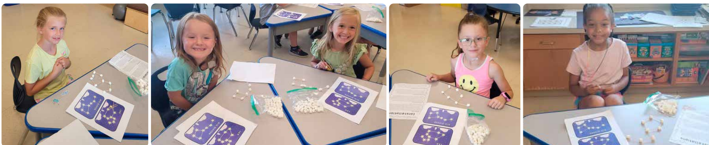
First Grade - Marshmallow Constellations