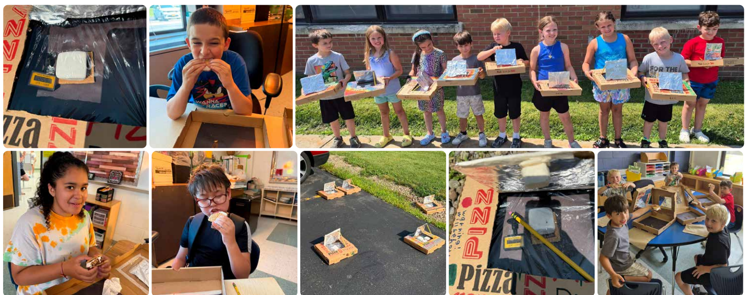
Solar Powered Ovens