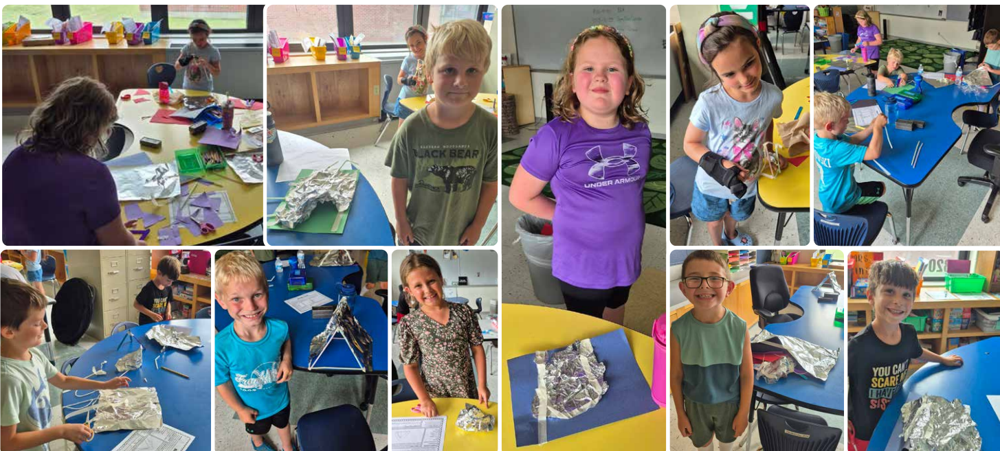
Second Grade - STEAM Projects